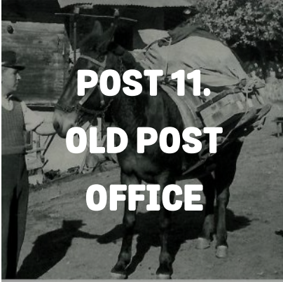
POST 11. OLD POST OFFICE