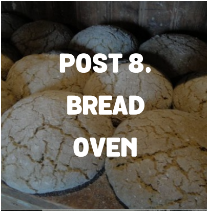
POST 8. BREAD OVEN