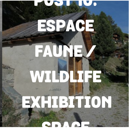
POST 10. ESPACE FAUNE / WILDLIFE EXHIBITION SPACE